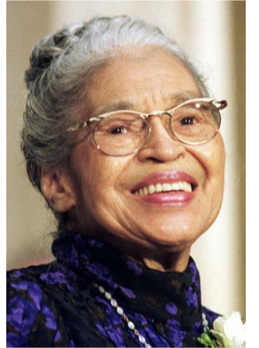
Rosa Parks in the early 21 st century

Rosa Parks used peaceful protest. She started a boycott of buses which lasted nearly a year. She organised car pools to enable people to travel together and avoid using buses.