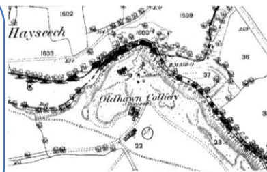
Fig. 38. Old Hawne Colliery in 1885

The earliest coalmine in Halesowen, for which there is some evidence, is the Old Hawne Colliery. It is marked on a map published in