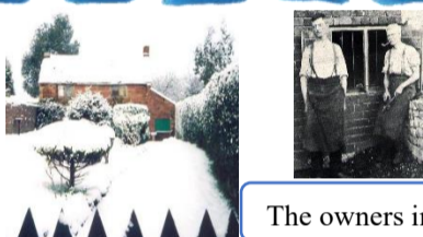
The owners in

It was a former farm labourer's cottage in the 18th Century and was later used as a