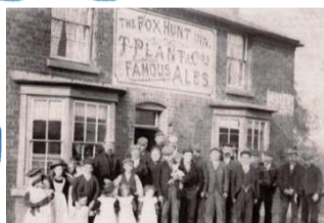
The Fox Hunt, Pleck Row