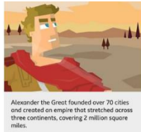
Alexander the Great founded over 70 cities and created an empire that stretched across three continents, covering 2 million square miles.

The Olympic games began over 2700 years ago in Olympia, in south west Greece.