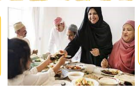
Eid-al-Adha Festival of Sacrifice